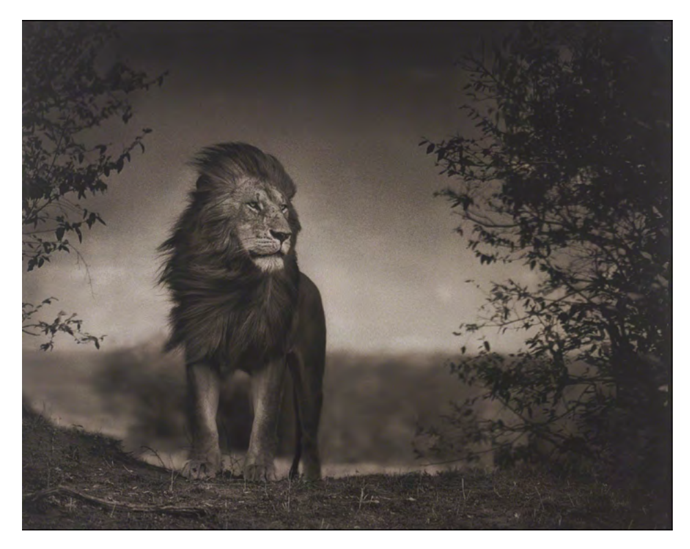
Nick Brandt, Lion before Storm , charity auction benefiting Earthday.org, sold on Artnet Auctions, Q1 2022 for 16,250 USD

The ESG report can be found on Artnet's Investor Relations page.