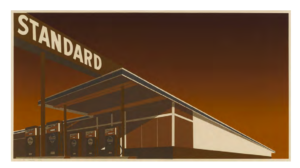
Ed Ruscha, Mocha Standard, sold on Artnet during Q1 for 150,000 USD

The art market saw a recovery in 2021, with transaction volumes returning to pre-pandemic levels. Signaling a shift in purchasing patterns, collectors are now increasingly comfortable in buying higher value artworks online. In 2019, the average price of an artwork sold online was 11,228 USD. In 2020, that figure jumped to 46,595 USD, and remained on an upward trajectory, rising 15 percent in 2021, to 53,685 USD. (Source: Artnet Analytics). This can also be seen in Artnet's increasing average transaction value (ATV) and success in higher price categories in 2021 and through the first quarter of 2022.