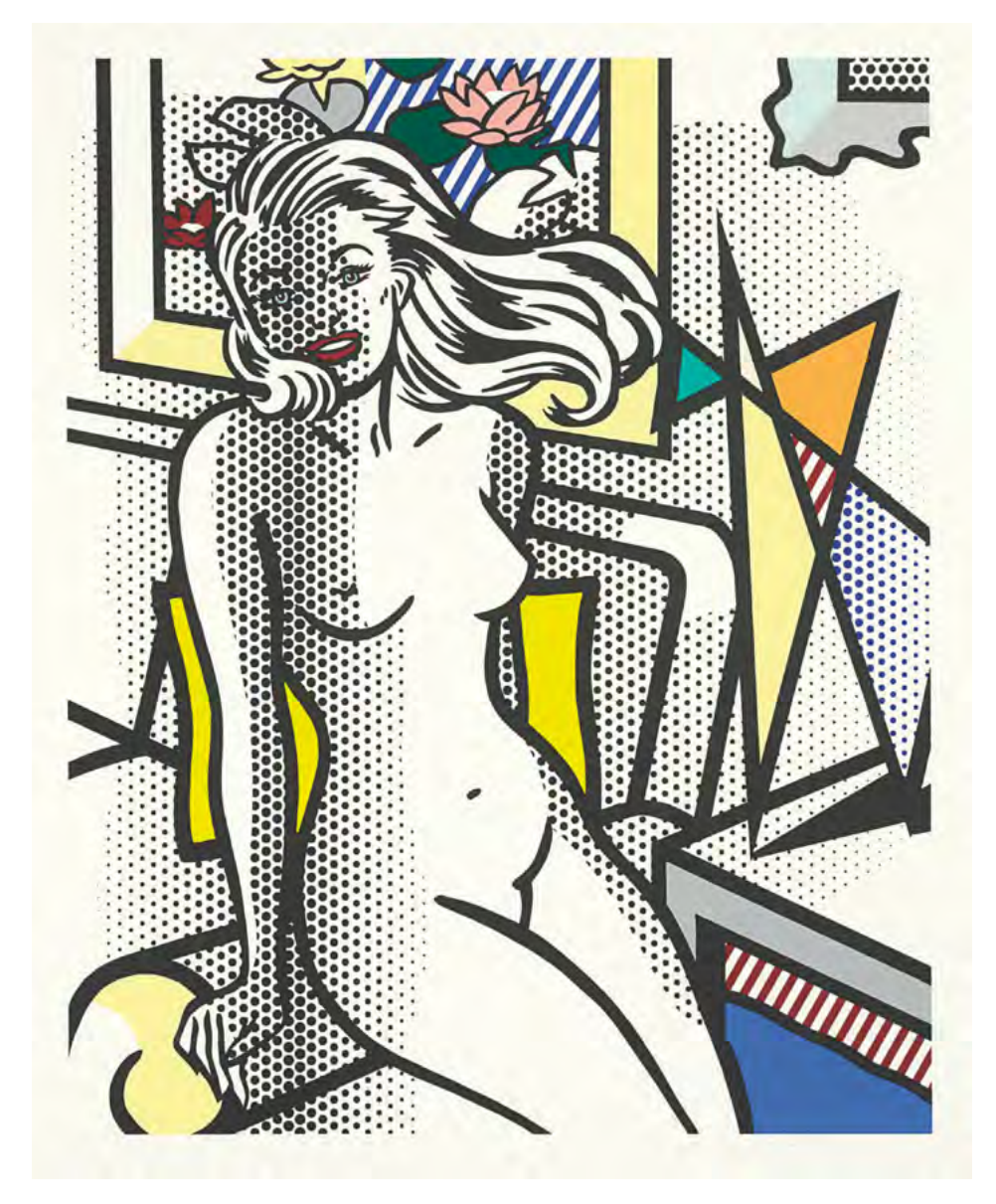
Roy Lichtenstein, Nude with Yellow Pillow, 1994, Versteigert auf Artnet Auctions für 425.000 USD

'Artnet was able to record growth in line with its Forecasts in Ql 2022 driven by continued strong growth in its Media segment despite an increasingly uncertain economic environment. Key product and technology developments are progressing as planned as the Company pursues its strategy of unlocking value through the realization of synergies between its core segments.'